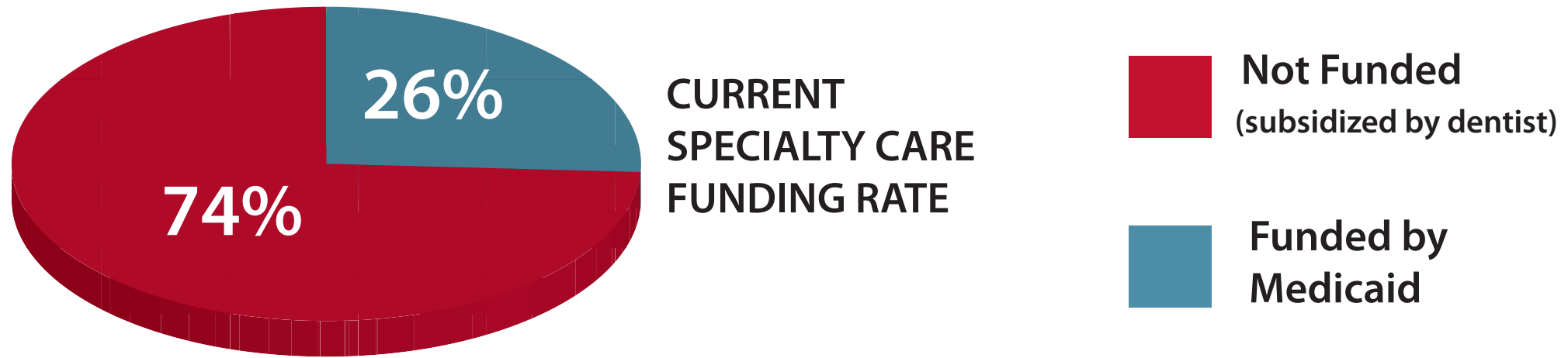
CHART 2: Funding Rates Fail to Cover Costs